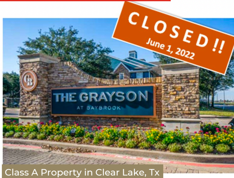
Class A Property in Clear Lake, Tx

In early June, Blacksteel Investment Group along with our partners and investors, closed on our 22nd property!! We are all so excited about The Grayson! This beautiful 322 unit, A class property is located in the fast growing southeast area of Houston, TX in the Clear Lake submarket.